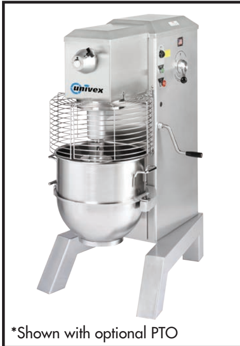
*Shown with optional PTO