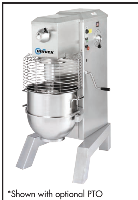
*Shown with optional PTO